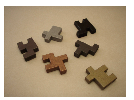
A good way to leave the puzzle pieces out on a coffee table are scattered about, this intrigues people and they just have to give it a try for themselves.