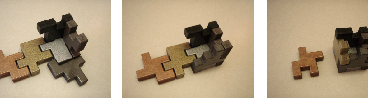
Finally flip the last piece over and nestle it into the top location.