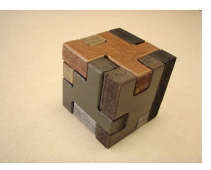
The puzzle is a 4" cube when fully assembled. There is only one correct way to assemble it, though there are several options that get one very close, but not complete!!

For this example six different spray paints were used to distinguish the different pieces. Three separate puzzles were being finished in the picture above, why not cut several projects to give to friends!