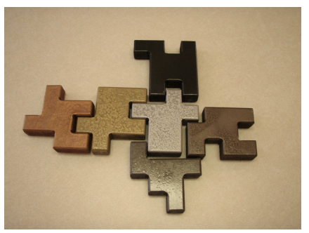
This picture is the key and solution to the puzzle. Follow the next four steps and a cube will be created.