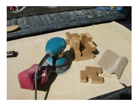
All of the pieces need to be sanded thoroughly. These will be handled by many hands and a sharp corner or splinter will really take the fun out of this puzzle.