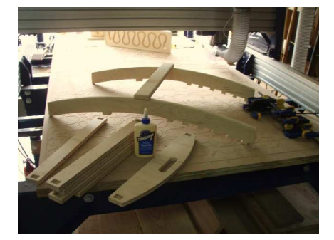
After the back slat has had time to setup, flip the assembly over and prepare to glue up the remaining parts of the chair.