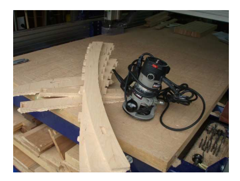
Routing a 1/4" roundover on all of the edges adds a lot to the look of the project and makes it nicer on ones hands when transporting the chair.