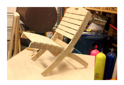
Once all the glue has setup, push your chair in to place and pull apart making sure everything looks and feels right before you sit on it.