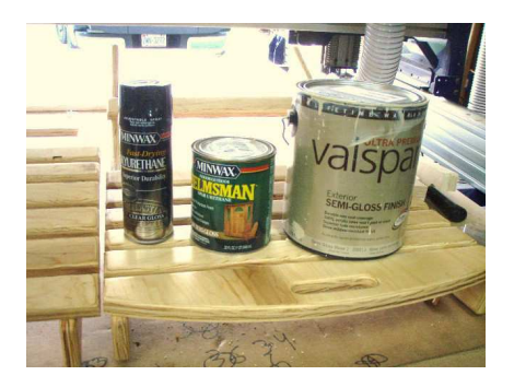
Ideally painting this chair would be easier done before assembly, it is easier to get to all of the pieces. However, it is not to much extra work to stain or paint the project after it is assembled. One can also venture into the spray finishes.