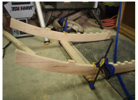
Start by gluing the back support onto the upper curved pieces. Clamp and allow glue to dry. Flipping the project over from here can allow wet glue to spill out of the dogbone corners on the mortise pockets.