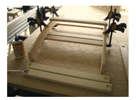
Work your way from one side to the other filling the tenons with glue, spreading the glue with a brush and applying a clamp to hold the pieces together until the glue sets up.