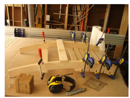
Clamping pressure should be kept on the assembly for a couple hours, this also means the chair should lay like it is pictured above during this time so glue does not run out of the dogbone corners.