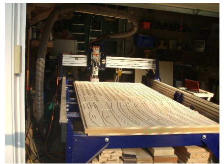
Two chairs can easily be cut from a 4' x 8' piece of plywood. Simply increase the quantities in the file and retoolpath.