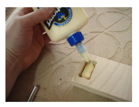
Fill the mortised pockets with a healthy amount of glue. This chairs will take a lot of abuse over the years, and without any outside fasteners the glue joints are the only thing that holds these chairs together.