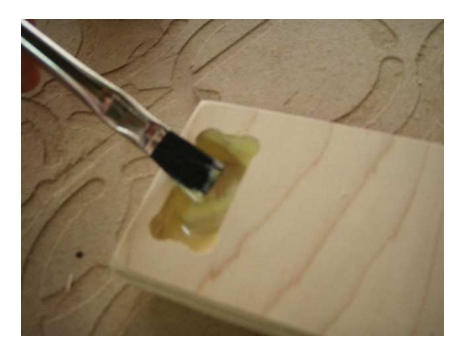
A small brush or your finger should apply the glue to all surfaces inside the mortise. This will ensure a properly glued joint.