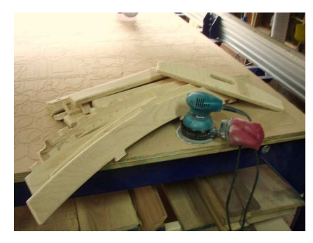
These chairs will be handled by many and sat on by many, a thorough sanding job on all faces and edges is highly recommended.