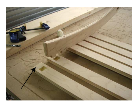
Move over to the seat portion of the chair. Fill all of the mortise pockets and start pushing the chair pieces together. Note the distance of the pockets from the end of the slats. The ones with the longest distance are used on the seat portion.