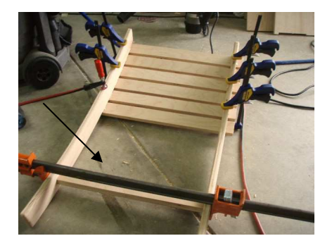
Add the lower support and clamp all of the pieces and let this assembly sit upside down while the glue dries.