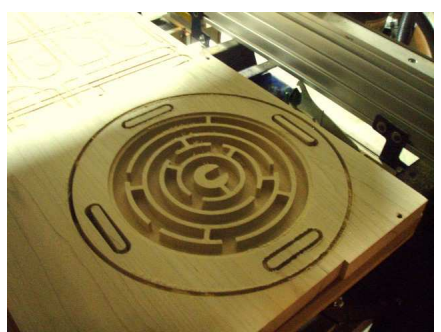
Once the piece has been cut, pop it out and sand all of the edges and faces. Make sure it is smooth for the marble to move around on.