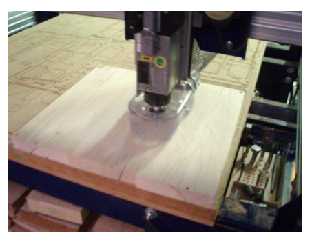
If you have a 18"x18" blank you can safely run a screw into each corner of your work piece, since you will be cutting a circle the screws will be far away from the cutter.