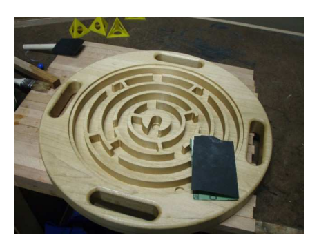
Before applying the finish it is a good idea to route all of the handles and outside edges of this project with a round over bit. This will make the project more comfortable to handle.