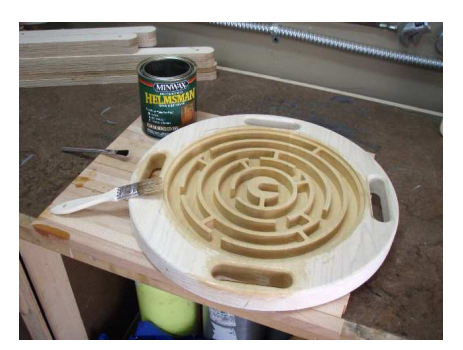
Finish the material with several coats and make sure all of the grooves are stained, once the glass is installed you will not be able to get back into this area.