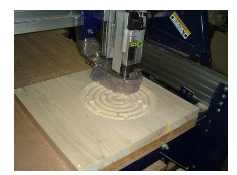
Keep you eye on the project, anytime you are cutting a file for the first time make sure it is dialed in for the machine you are cutting it on.