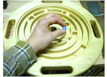
Make sure your marble floats around your project freely before moving to the next step. This project can be upsized or downsized depending on the size marble you want to use. Up to a 5/8" diameter marble will work for this file.