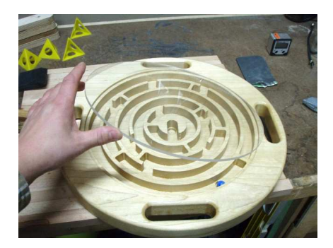
No glue is used for the glass because it will show through. Make sure the glass or plastic is clean on both sides before installing.