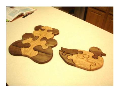
The puzzles look great and are loved by all who use them. However they are harder then they look because when parts are flipped over they do not fit with other parts that are not flipped over.