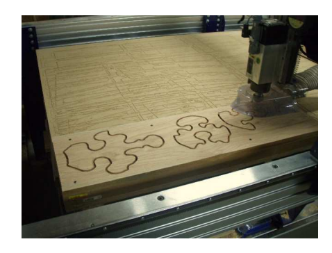
The same goes for the red oak piece, there is a toolpath file for hold down and tabs will need to be removed.