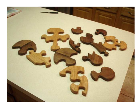
Apply a mineral oil that is food grade in case some of these pieces end up being chewed on by little ones.