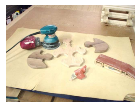
Sand the puzzle pieces thoroughly. These will be handled by many people over time and they should be very smooth.