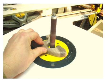
Due to the superior accuracy of the ShopBot some of the parts will be hard to fit together at first. Use a spindle sander to open up some of the pieces to fit together nicely.