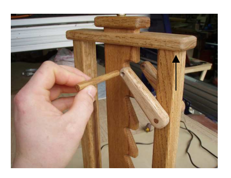
Make sure the ratchet lock is positioned like it is in the picture before inserting the second dowel. Failure to do so will prevent the lock from working properly.