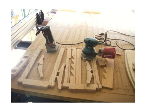
Once the parts have been cut take some time to sand all the edges and faces thoroughly. A routed edge on the outer edges will add some character to the project.