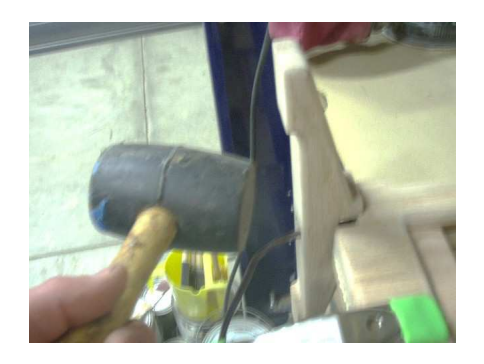
Use the next few pictures to see how the main assembly is glued up. It is the same process as how the ratchet piece was assembled. Above the leg is pushed into place with a rubber mallet.