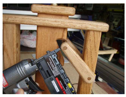
Using a small pin nailer plug a couple pins into the dowels to keep them from falling out. If no pin nailer just dab a little glue in the hole and it will hold just fine.