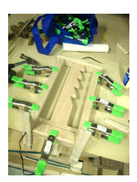
The inner ratchet should move freely inside this assembly. If it does not something is wrong. That is why it is always recommended to do a dry fit before applying glue.