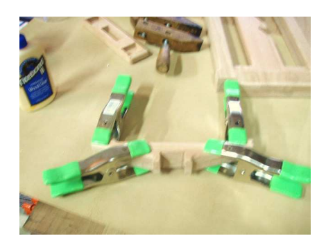
Spring clamps have enough pressure to keep the parts held together. Make sure the pieces are as flush as possible with each other to cut down on sanding time after the glue is set.