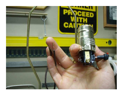
110volts of electricity is going to be running through this project, so improper installation can cause failure to the project and even result in a fire.