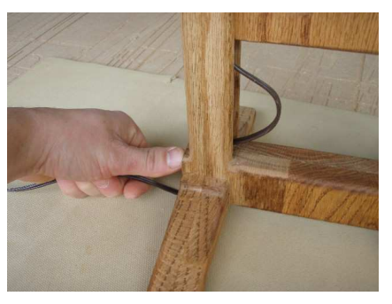
As one ratchets the lamp up and down the cord will pop out under the ratchet. Simply pull the cord back out by pulling down and off the side with the cord and it will pull back in.