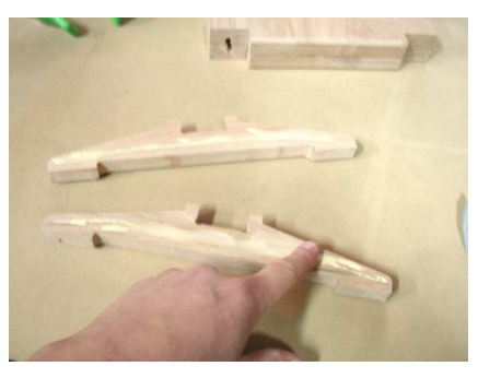
Start by gluing up the feet, that way they can sit aside and the glue can setup while you work on other parts.