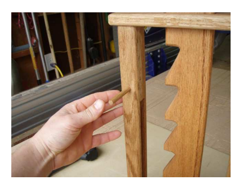
The last step is installing the ratchet lock. Oak dowels can be found at your local hardware store to match your project, or stay with the standard poplar lighter colored ones if you desire.