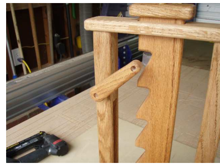
Install one side and flush the dowel with the lock. Your particular dowel length can be measured by using the thicknesses of your parts.