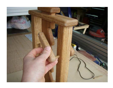
Push the other end onto the dowel and flush that end as well.