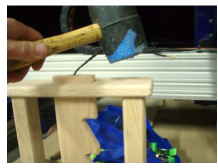
Secure the top by pushing the ratchet inside this piece and pushing down onto the columns.