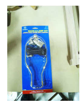
Lamp kids are available and your local hardware store, Lowes, Home Depot, Wal-Mart. They have everything needed to wire up a complete lamp. The cost on these is approximately $10 depending on your area.