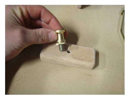
The hole that comes in the file is left small on purpose. Certain lamps may call for different size nipples to be used in their kit assembly.