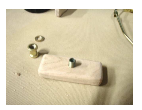
Using a hand drill make the hole just smaller than the diameter of the threaded nipple. This way one can screw the nipple into the wood and use a little epoxy if necessary to hold in place.