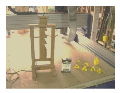
Once everything has had a chance to dry, recheck all your sanding edges. Then apply a stain to give the wood some color followed by several coats of polyurethane to seal the wood.