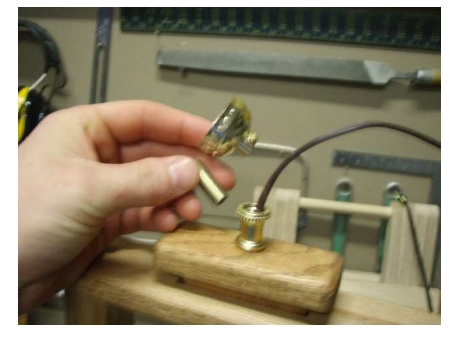
Follow the instructions that come with your particular lamp kit. That is the only way to know how to properly install the electrical components.