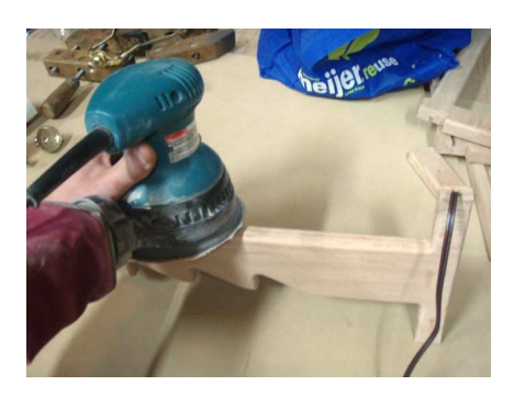
Sand the new glue up to make sure everything lines up and is smooth.