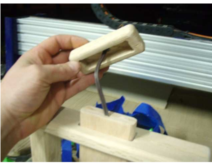
Apply glue to the underside of the top piece and slide it into place.